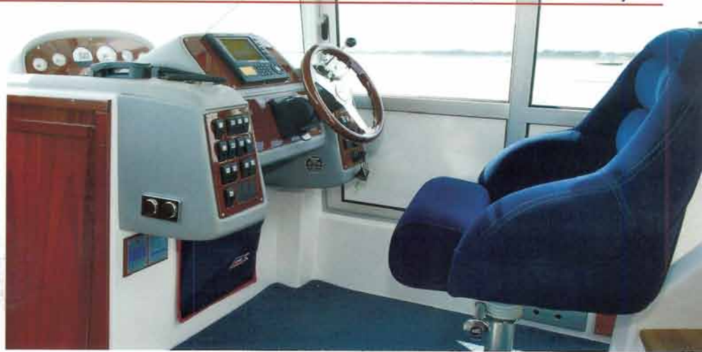
above When it comes to the helm, this armchair-style seat means skippers have never had it so good.

The electric windlass is standard and the