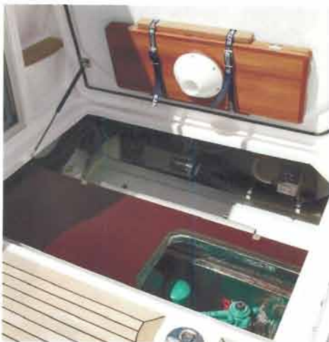
above Sizeable hatches allow easy engine access.

✓✓✓✓✓ Light on engine options, but tidy installation and minimal sound levels.