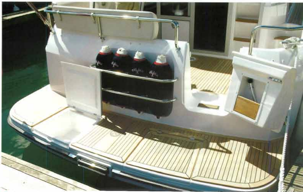
below The bathing platform has the same high standards as elsewhere, with nice teak-finished decking.