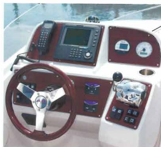
above Clear control layout is another plus here.