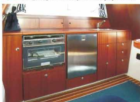
below ...and an excellent array of storage options.