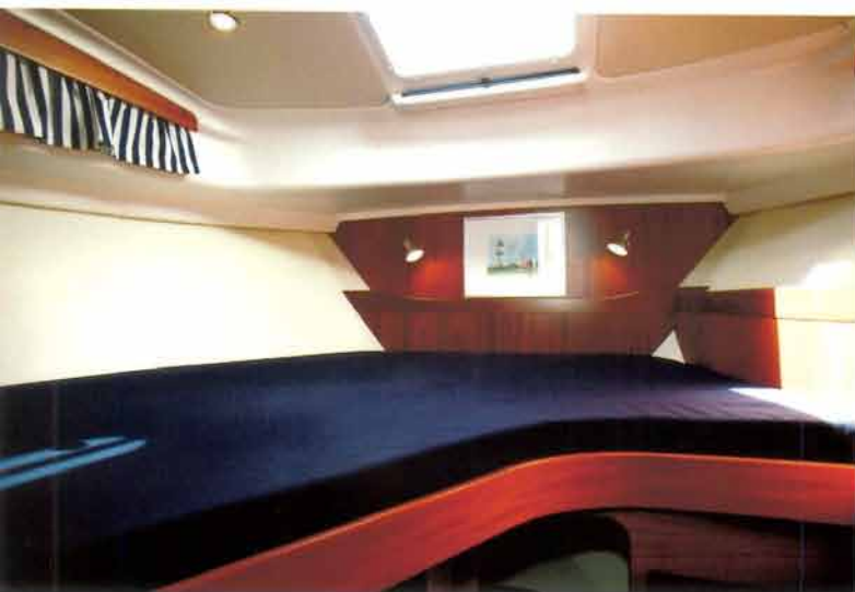
below This is an exquisitely well designed and finished boat, with plenty of storage, stylish mahogany detailing and a reasonably sized washroom.

A couple of steps up and you are in the wheelhouse, which as well as being perfect for taking in the views, is clearly the preferred spot